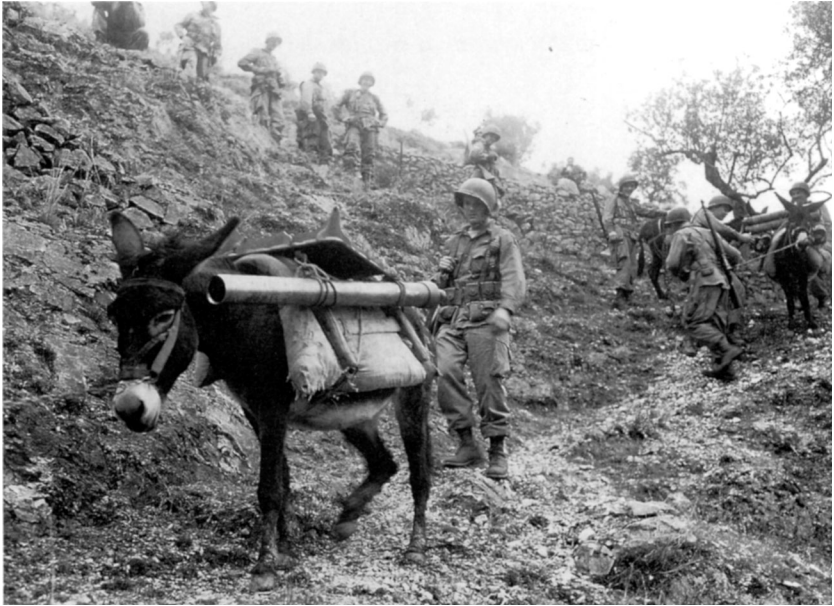
Pack train moves supplies in the mountains.

Infantry Division, for example, had seen its effective strength reduced to sixty men; the 2d Battalion of the 143d Infantry, which had been in the Sele River corridor, had almost ceased to exist as a unit. Meanwhile, the British Eighth Army continued its advance as the Germans disengaged at Salerno and withdrew north. By 19 September, elements of Montgomery's and Clark's armies met at Auletta, twenty miles east of Eboli.