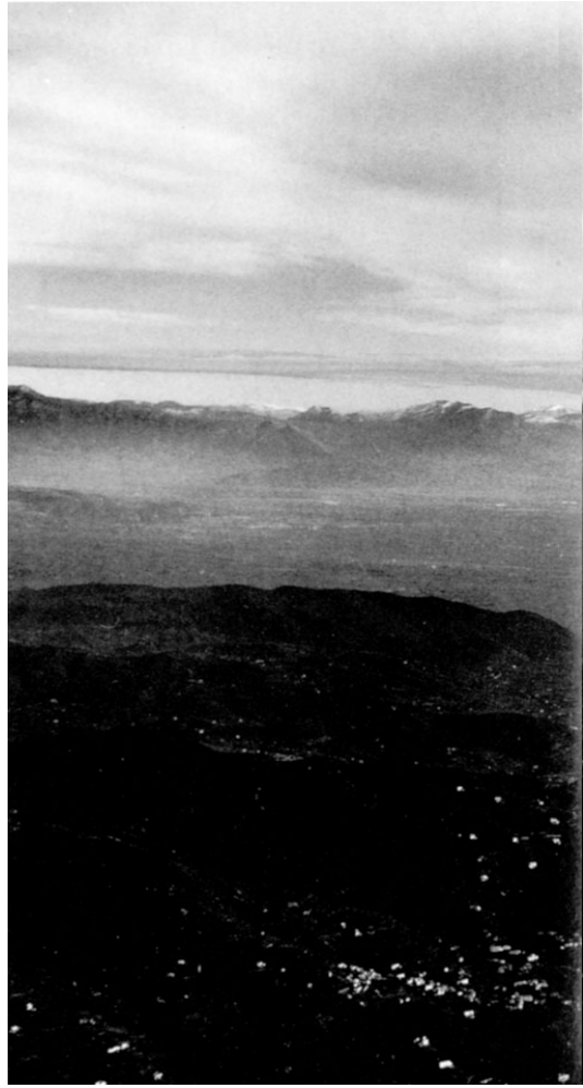
The Gulf of Salerno.

Clark expected to meet some 39,000 enemy troops on D-day and about 100,000 three days later after German reinforcements rushed to Salerno. He hoped to land 125,000 Allied troops. The British 10 Corps on the left was to land its two divisions abreast south of Salerno. The U.S. Rangers and the British Commandos were to land at beaches west of Salerno and secure the left flank by seizing key passes through the mountainous Sorrento peninsula between Naples and Salerno. Control of the passes would permit a rapid exit from the Salerno plain and protect the beachhead from German counterattacks