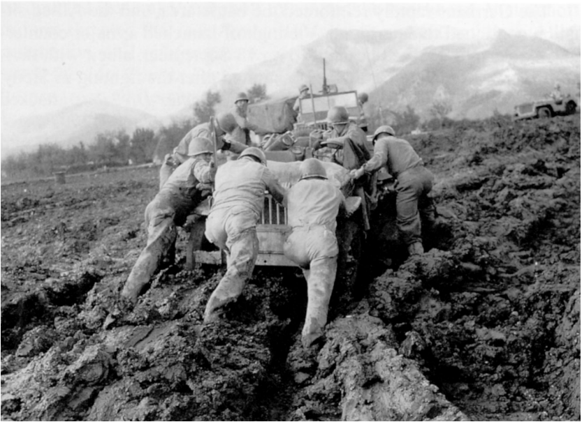
Waging war against mud.

miles north of the British 10 Corps on the evening of 14 September to disrupt German resupply and communications lines. The paratroopers had been ordered to harass the Germans for about five days and then either to infiltrate to the beachhead or to link up with advancing forces. Of the 40 planes involved in the operation, only 15 dropped their cargo within 4 miles of the drop zone; 23 planes scattered paratroopers between 8 and 25 miles from the intended target, and the drop site of the remaining 2 planes was unknown. Of the 600 men who jumped, 400 made it safely back to Allied hands several days later after launching small raids in the German rear.