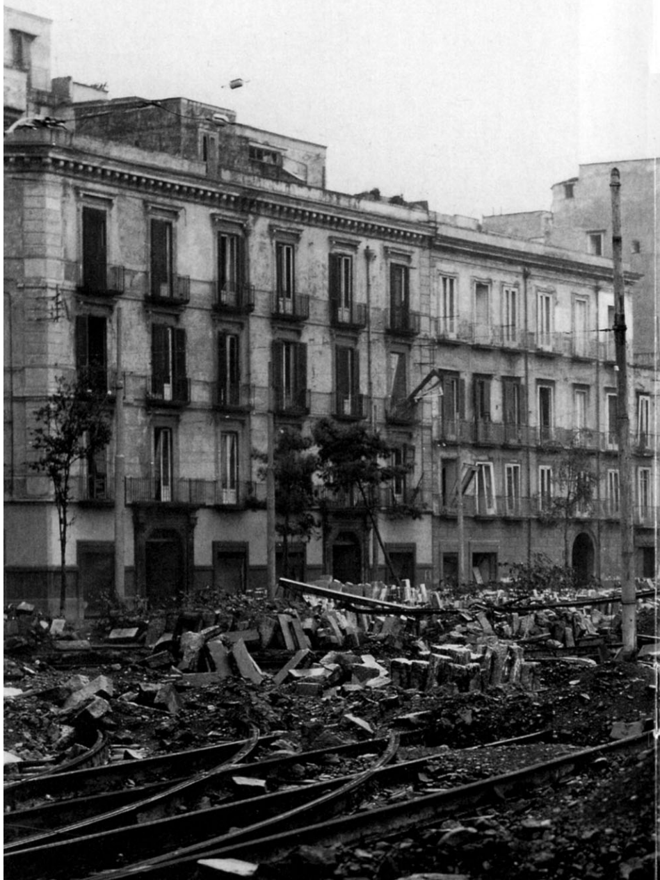
Wreckage in the dockyards at Naples.