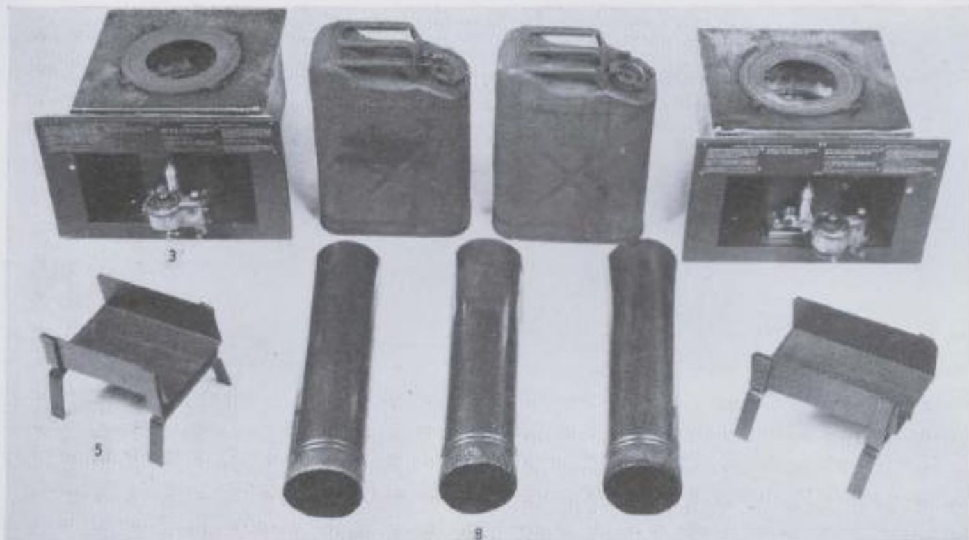
Figure 1. Outfit, Burner, Pot Type, Oven, Bake, Field, M-1942, Complete.