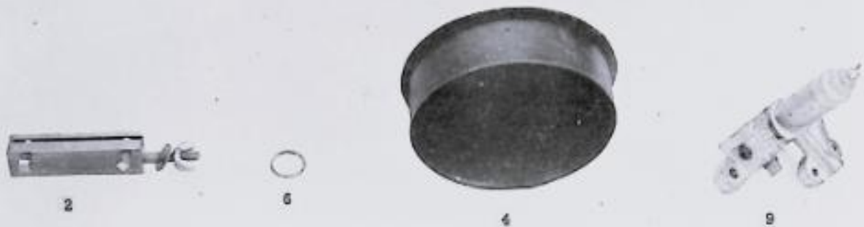
FIGURE 2.—Spare parts for outfit, burner, pot type, oven, bake, field, M-1942.