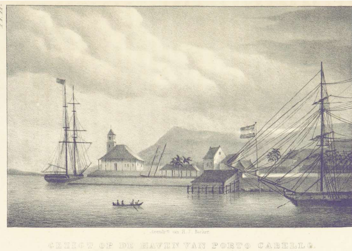
Porto Cabello