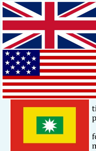
The national flags, in 1813, of: Top: Great Britain. Middle: USA Bottom: Cartagena

Aury's cunning plan unravelled when Rise and the original crew of Jane returned to Beaufort, recognised their ship despite her new coat of paint and informed