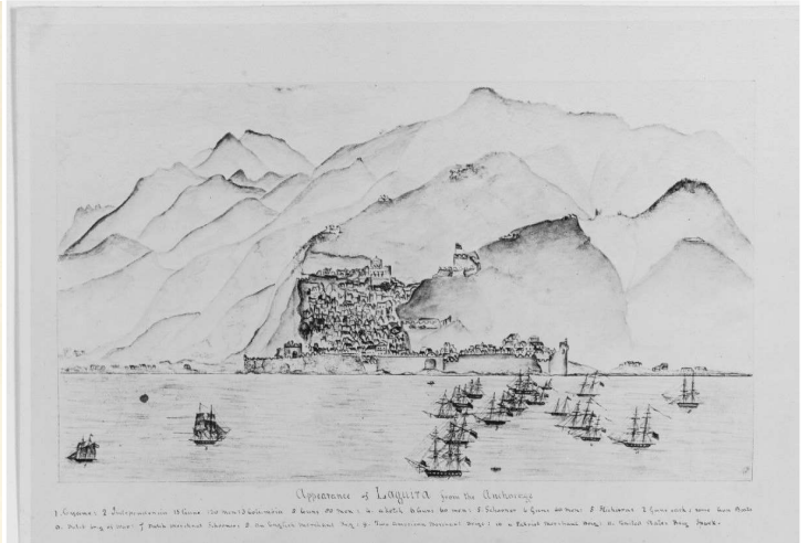
USN drawing of Laguira Harbour ( https://www.history.navy.mil/our-collections/photography/numerical-list-of-images/nhsc-series/nh-series/USN-901000/USN-901914.html )