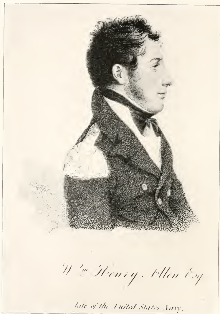
ENGRAVED BY DAVID EDWIN Frontispiece to "The Port Folio," January, 1814