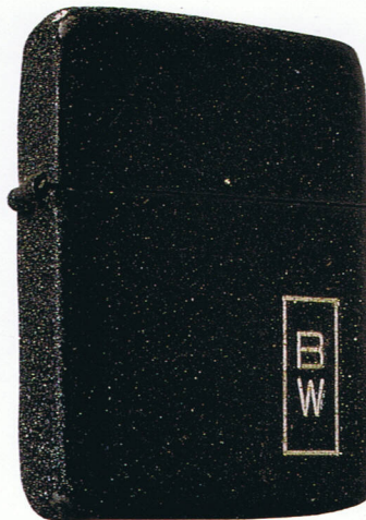
#28 A, $225-$300

Sterling models made during this time span had sterling written under the three barrel hinge in block