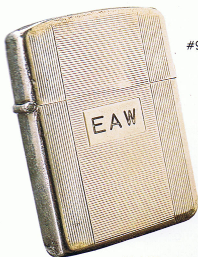
#9 E, $700-$800