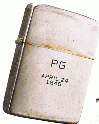
#9 A, $225-$300