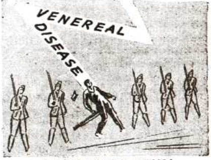
A LOSS TO THE TEAM!

Disciplinary training is a two-way street. It does not merely lead to military proficiency, to the army's own ends; it leads also to selfdiscipline, to the individual soldier's private benefit wholly apart from its benefit to the army. If you learn, for example, to take care of