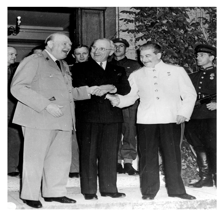
Churchill, Truman, Stalin