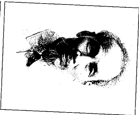
Ho Chi Minh of Vietnam