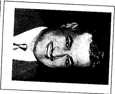
Nasser of Egypt