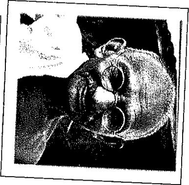
Gandhi of India